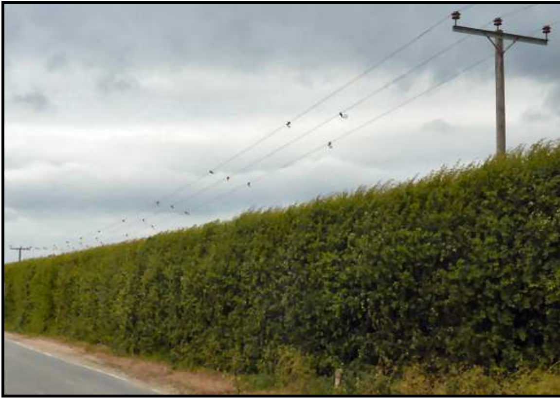
Taken from roadway