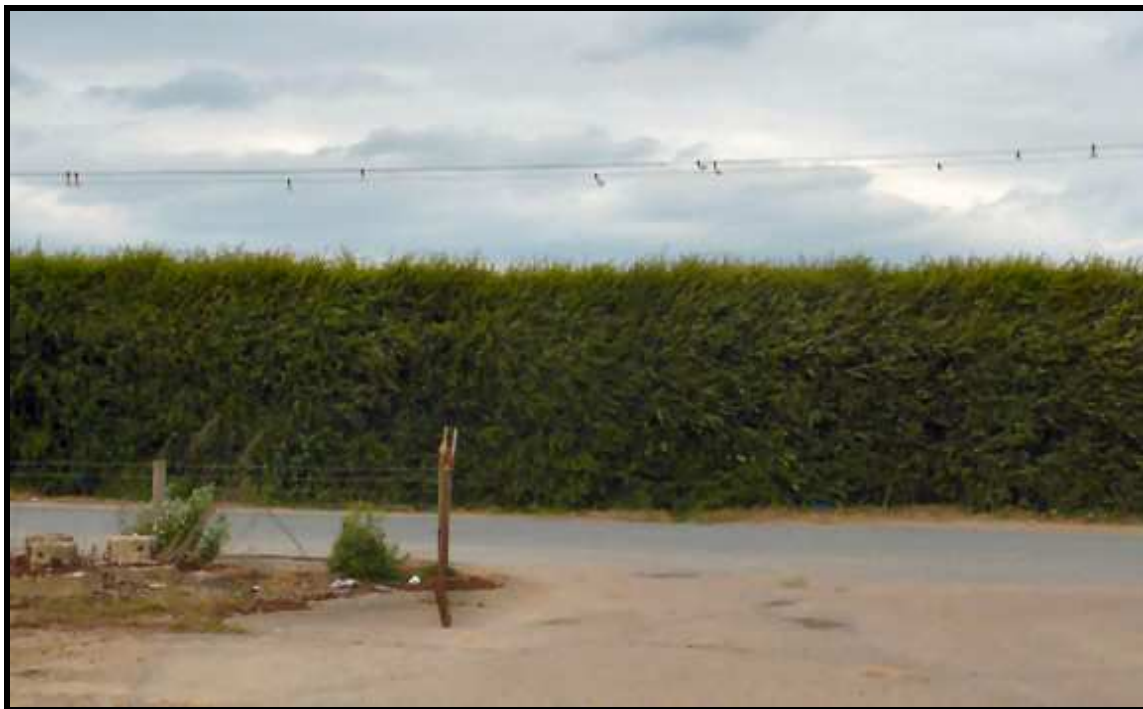
Taken from near the end of runway. Note the landing threshold is displaced a further 100m into the runway.